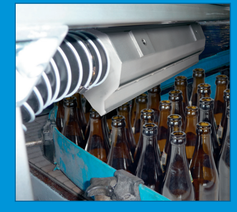
Drying after bottle cleaning

parts, components and surfaces must be freed from acids, bases or oils etc. in the plastic or metal machining, the Ziegener + Frick air knives are able to perform effectively and economically to the highest degree.