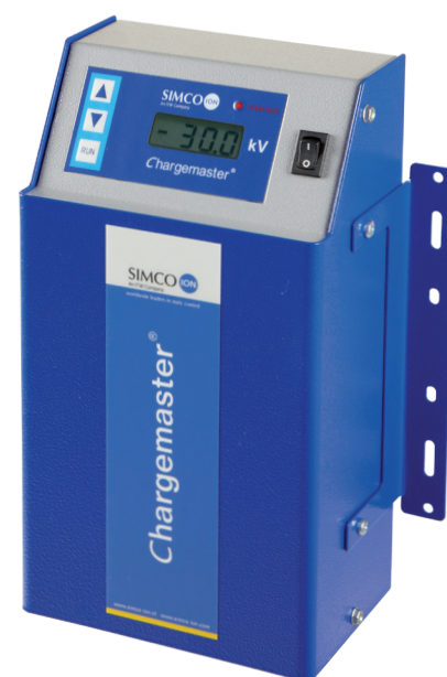
CM Medium for wall mounting with 180° turned frontpanel