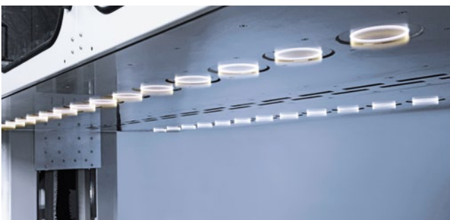
Installation for Openair-Plasma® coating