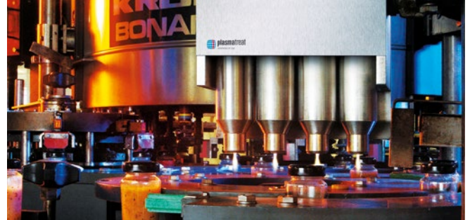
Pretreatment for the adhesive bonding of safety labels