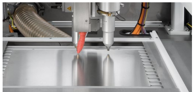
PlasmaPlus® in a Plasmamatreatment Unit (PTU)