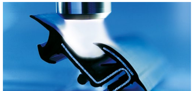
Gap-filling pretreatment of EPDM profiles