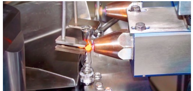
Heat sealing of glass ampoules for medical applications