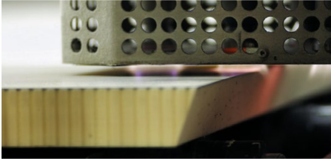
Large-area pretreatment of insulated side panels for the automotive industry

production units through to complete systems controlled by microprocessors our systems are available to you in the most varied performance categories.