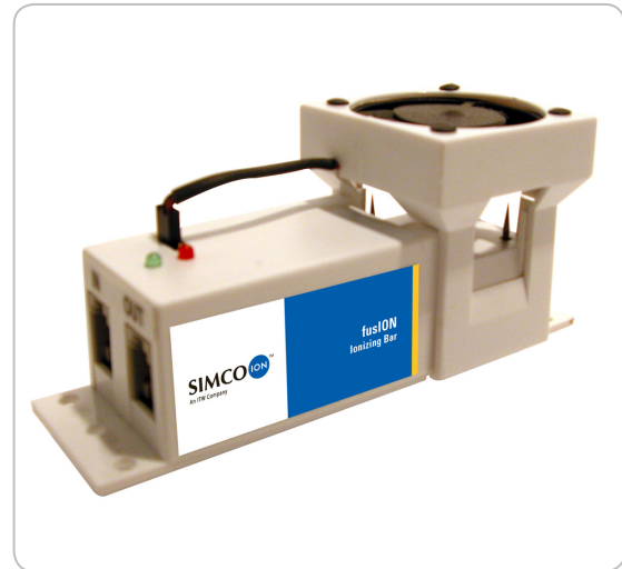
fusION with Fan Attachment

The performance of any ionizer, including fusION, can be improved with the addition of controlled airflow. In applications that may benefit from improved airflow, an optional fan assembly is simply clipped to the fusION housing and power to the fan is supplied through a built in connection.