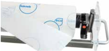
Low Static Adhesive

Note: If Roller Top Lift & Top Drive are fitted there is a change to the standard roller carriage which removes the quick removal feature.