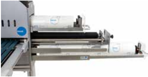
Low Static Cleaning

Teknek raise the bar in contact cleaning with the introduction of a ground breaking “Low Static Cleaning System “. The patented NT elastomer and GAR adhesive combine to provide Teknek Cleaning performance with low static levels.