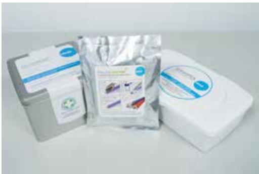
Roller Maintenance Products TEKWIPES: MI6700C Roller Doctor: PL63097

"More STANDARD conveyor options available"